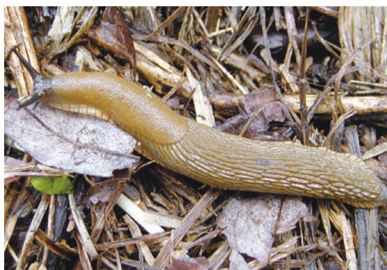
Figure 1 | Arion lusitanicus — conservation agent.

grassland sown with rye grass ( Lolium perenne ) and white clover ( Trifolium repens ) on a former arable field that contained its own residual seed bank of weed and other plant species.