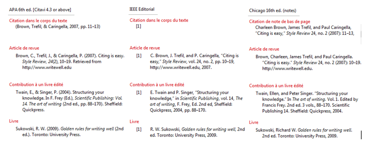
Figure 1: Citation styles APA 6th, IEEE Editorial and Chicago notes 16th

Examples of current citation styles (taken from the reference management software, Citavi, read more in chapter 6):