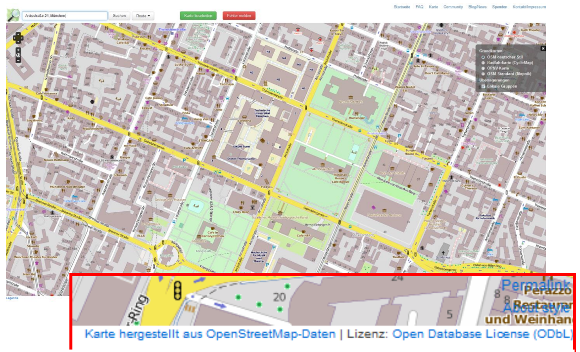
Map 1: Arcisstraße 21, Munich (Open Street Maps, 2016), published under Open Database License ODbL

Open Street Maps, Germany (Cartographer). (2016). Map Excerpt Arcisstraße 21, Munich. Map created from Open Street Map data. Open Database License ODbL (http://opendatacommons.org/licenses/odbl/). Retrieved from http://www.open-streetmap.de/karte.html?zoom=17&lat=48.14842&lon=11.56825&layers=B000TT, on 18.05.2016