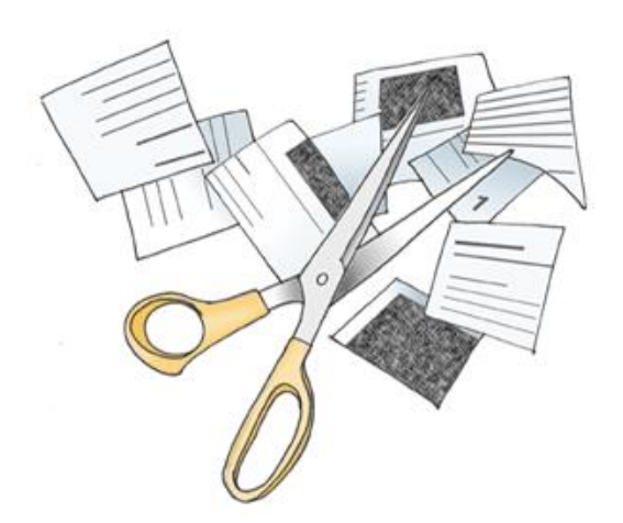
Figure 2: How Plagiarism Works (Weber-Wulff, 2004b)

Example of an image with the source cited in the references: