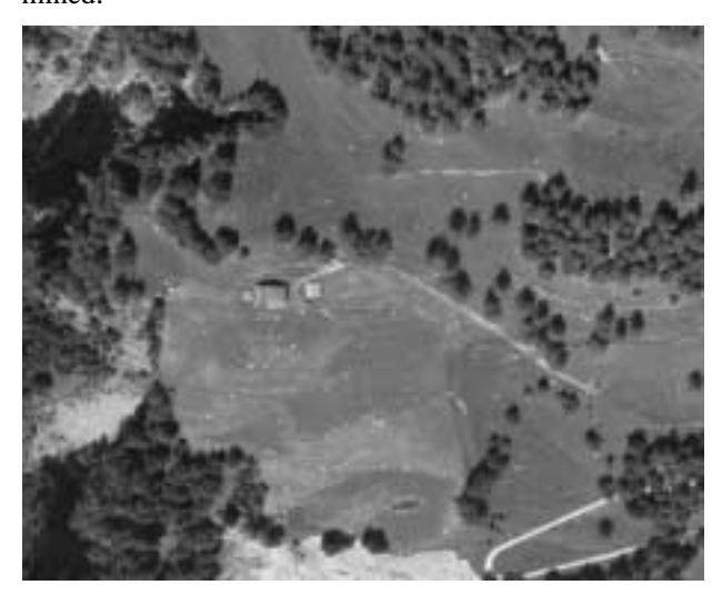
Figure 3: Talegnas land slide - overview image

where distressing cravasses had occurred in recent time. The aim of the study was the examination of the suitability of digital photogrammetry for 3-D deformation measurements in land slide areas using signalized or natural points. In addition, a digital terrain model had to be determined.