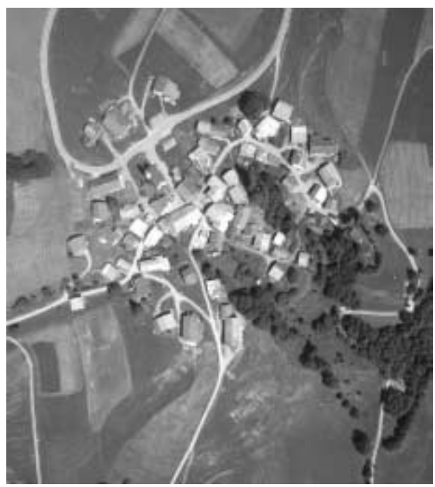
Figure 2: Overview image of Urmein

The pilot study 'Urmein' (Kersten, 1996) was conducted in 1995 over an alpine village covering an area of approximately 500x500m^2 with 130m height difference. The aim of the study was the determination of coordinates of signalized points (e.g. for cadastrial photogrammetry) and the derivation of an orthophoto. A total of 50 images was captured with a Kodak DCS200 equipped with an 18mm lens. The flying height above ground was 350m, corresponding to an average image scale of 1:18'000. The average image overlap was 70% both along and across stripes, with relatively large deviations dur to navigation and handling problems. Reference coordinates of 36 signalized points, which served as control and check points, were determined with GPS.