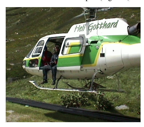
Figure 1: Hand-held use of a stillvideo camera in a helicopter

For the pilot studies described in this report, a Kodak DCS200 and a Kodak DCS460 were used; both were operated hand-held from a helicopter (Figure 1).