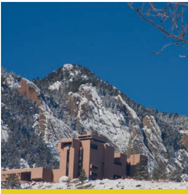
NCAR in Boulder, CO