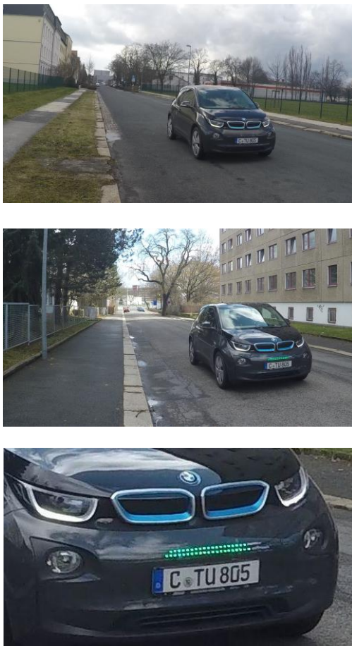
Fig. 1. Screenshots out of the video material. (top) recording site one, no frontal brake light activated, (middle) recording site two, frontal brake light activated, (bottom) close-up of frontal brake light

In our experiment, we used video clips (30fps, 1920x1080 px) of a vehicle approaching (Fig. 1, top) with an initial speed of either 30 km/h or 50 km/h, as well as decelerations of either 3.5 \text{ m/s}^2 or 5 \text{ m/s}^2 (until the vehicle came to a standstill). In addition, the initiation of the deceleration was varied with regard to its physical distance from the camera position (30 m or 20 m from the camera) and its time distance from the start of the video (3 s or 4 s), in order to prevent participants from using strategies that would be based on such aspects. The use of video material from two different sites was supposed to further impede the development of such strategies. To reduce the predictability of the scenarios, we also created video clips in which the vehicle did not decelerate, but rather passed the observer's position at unreduced speed (30 or 50 km/h). From each site,