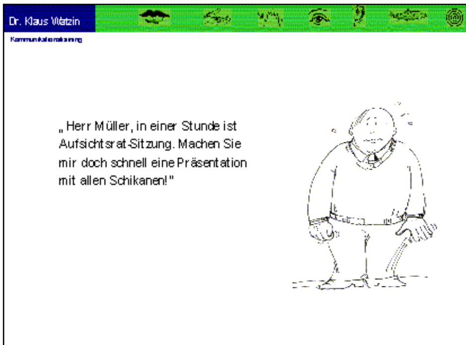
Fig. 4: Picture Elements: Picture 2 (Berendt et al., 2002, D 2.1: 11)