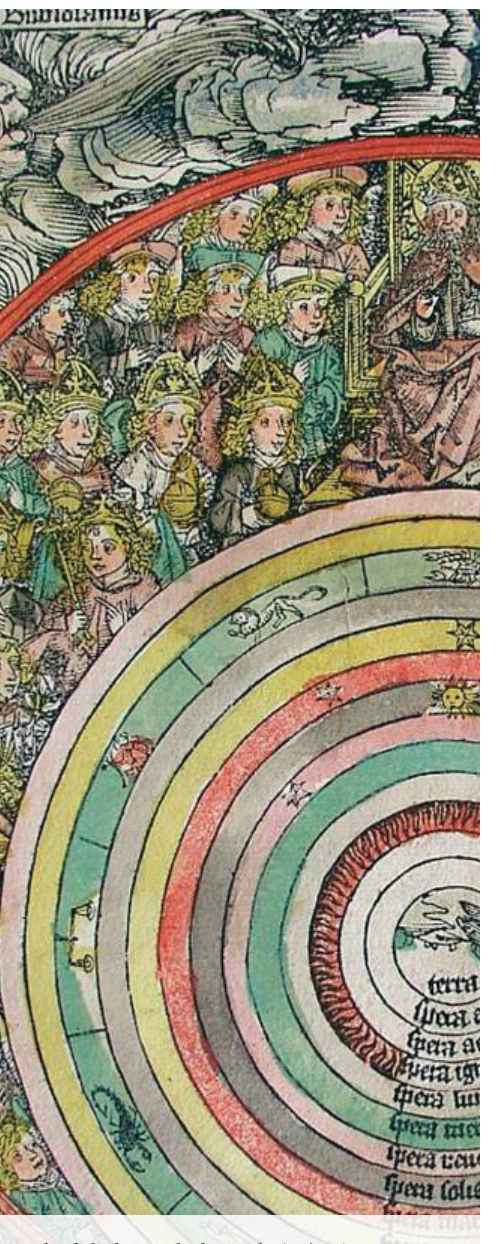
Schedelsche Weltchronik (1493)

This two-and-a-half-day conference seeks to explore this paradox more deeply through the lens of three specific perspectives. Through the perspective of "Access," it will explore how women and men in the premodern era sought to approach and to encounter transcendent power, or sought to prevent others from doing so. Through the perspective of "Use," it will explore how they sought to control, to deploy, or otherwise manipulate transcendent power in the pursuit of what were often all-too worldly interests of power, politics, family, and money. And through the perspective of "Embodiment," it will explore how the transcendent, paradoxically, took root in this world, in sacred objects, spaces, and so on, and yet also pointed to the world beyond.