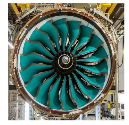
Rolls Royce UltraFan engine [RR19]

The suitability of the diffraction grating method to measure vibrations of mechanically excited rotors shall be experimentally determined. Furthermore, the results shall be compared to available strain gauge and distance sensor techniques.