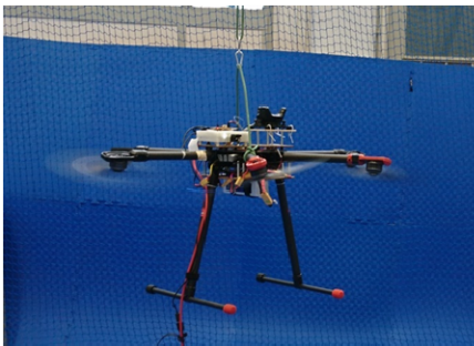
Flight test with fully actuated UAV at TU Dresden