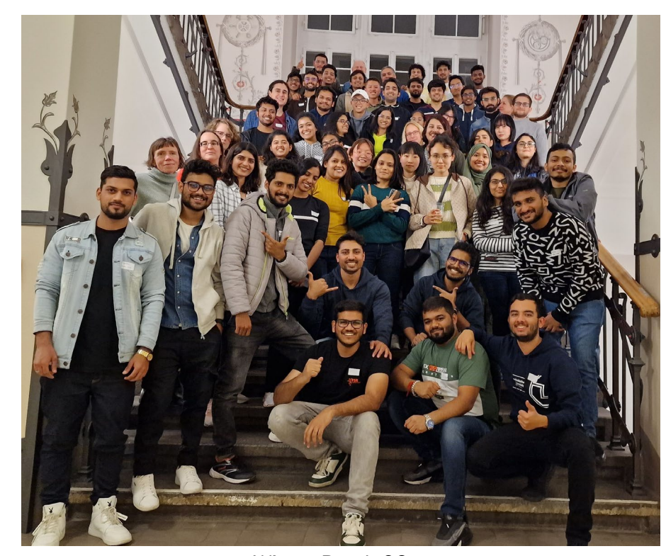
Winter Batch 23

Forge lasting connections with mentors and peers. Cultivate a network of support and inspiration to propel your journey towards success.