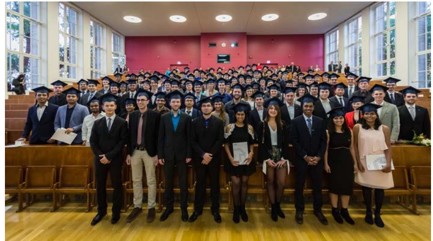
Tag der Fakultät 2017