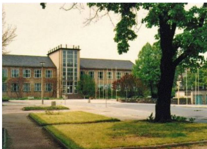
Barkhausen-Bau: Main entrance seen from Mommsenstr.

The summer school will take place at Barkhausen-Bau, the main building of the previous faculty of electrical engineering, mainly in room 106 (ground floor) and room 218 (first floor), for details see https://navigator.tu-dresden.de/etplan/bar/01 . On Saturday, we will have the Network Coding sessions in the Falkenbrunnen, Würzburger Straße 35, in room FAL 07/08 for details see https://navigator.tu-dresden.de/etplan/fal/00 .