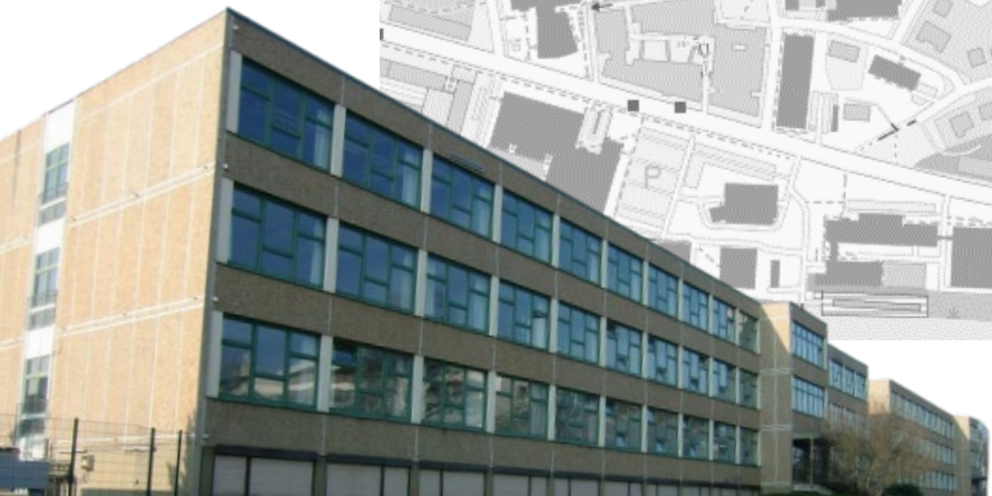
Seminargebäude 1, Zellescher Weg 22