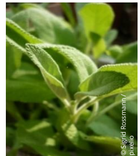
Sage salvia fruticosa