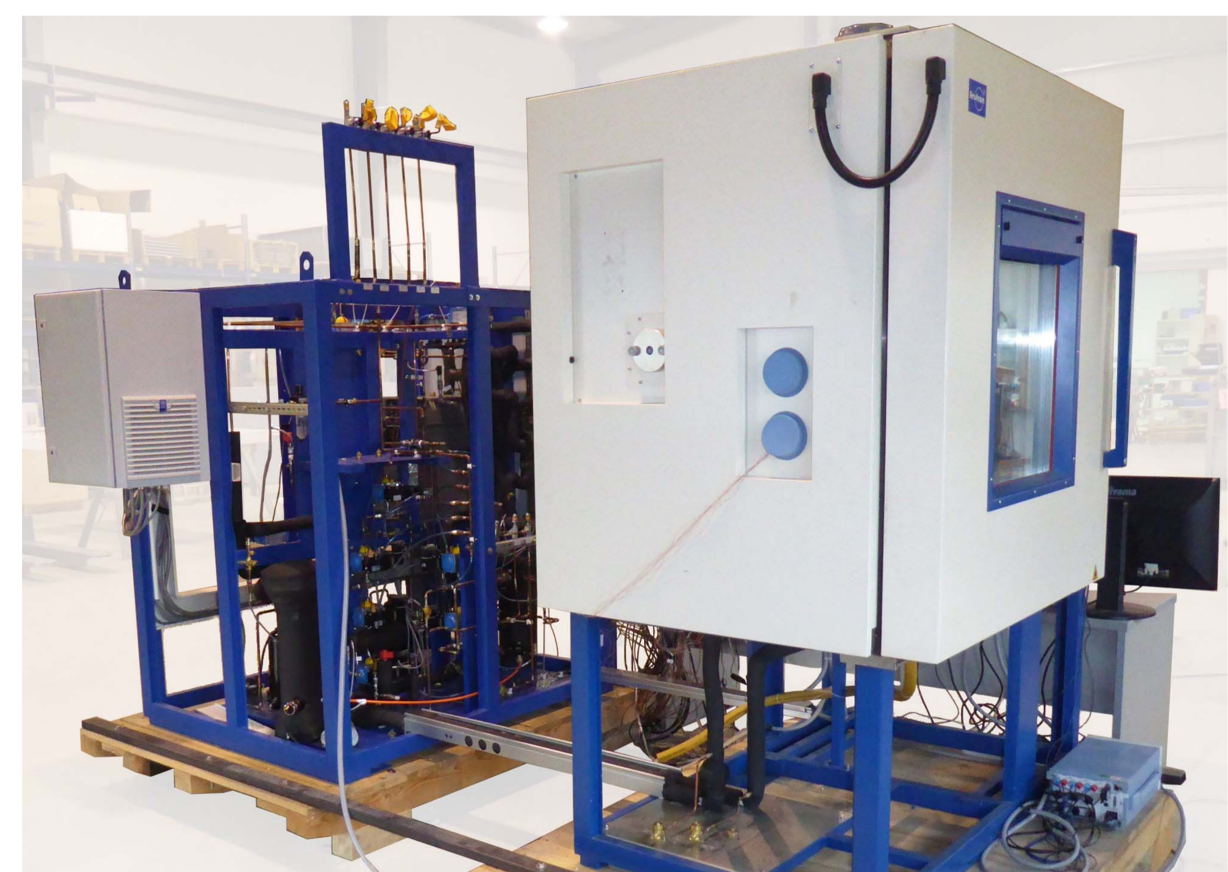
Fig. 3: Test rig of an environmental test chamber using CO 2 as refrigerant for cooling and heat-pump operation

duration: 04/2017–07/2019, BMWi, ZIM fund.-no. ZF4005606-ecoKPK