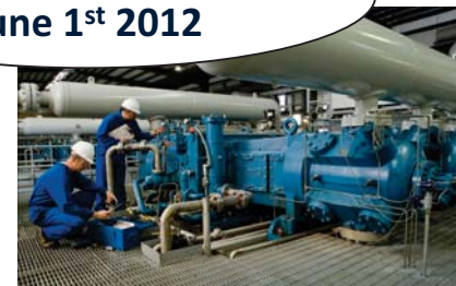
By courtesy of: ARIEL