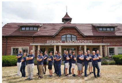
Participants (IRCC 2019) at Purdue University, West Lafayette IN (USA)

Discover interesting lectures, excursions and laboratory work in the fields of energy and process technology, investigation of physical property and environmental protection with the application in refrigeration and compressor technology!