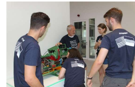
SCHAUFLEER Academy, Rottenburg (IRCC 2019)

https://tu-dresden.de/ing/maschinenwesen/iet/kkt