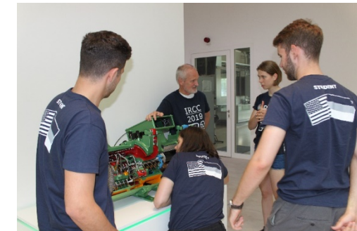
SCHAUFLER Academy, Rottenburg (IRCC 2019)