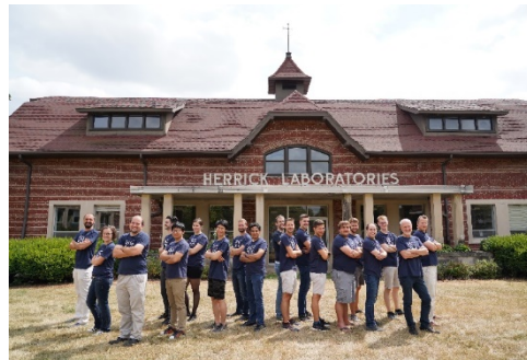
Participants (IRCC 2019) at Purdue University, West Lafayette IN (USA)