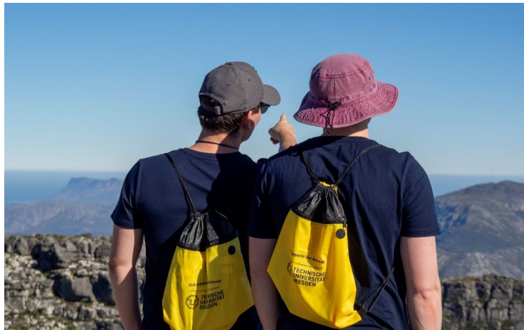
© Richter | Volkmann | Reeb