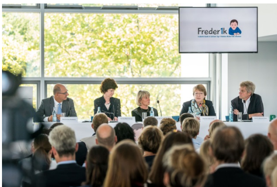
Press Conference about Freder1K study.