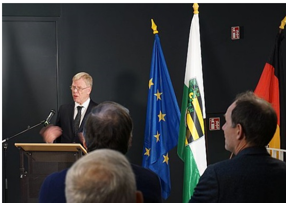
Minister of Finance, Prof. Unland, ceremonially opens the Hermann Krone Building.

The new building provides 3500 square meters of space for laboratories, some of them of cleanroom quality. The building is equipped with a 400-square-meter solar facility on the roof and is heated with waste heat from the TUD high-performance computing centre. The construction costs amounted to just under 30 million Euro. Researchers from the Dresden Integrated Center for Applied Physics and Photonic Materials (IAPP) and from the Center for Advancing Electronics Dresden (cfaed) will be moving into the new rooms. Overall, approximately 120 researchers will have jobs in the building, working – among other things – on the development of high-precision measuring methods in the nanometer range.