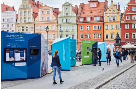
DDc's science exhibition at a central location in Wrocław, Poland.